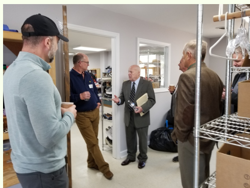
Touring the Facilities