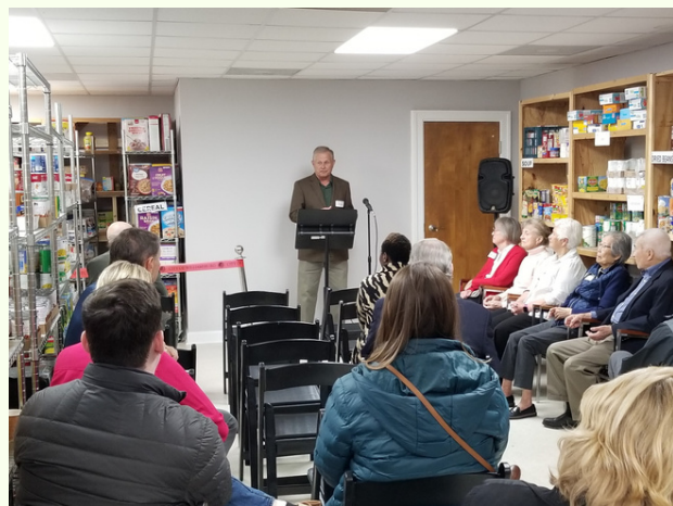
Dedicating the New Location