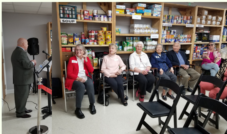
Honoring the Founders