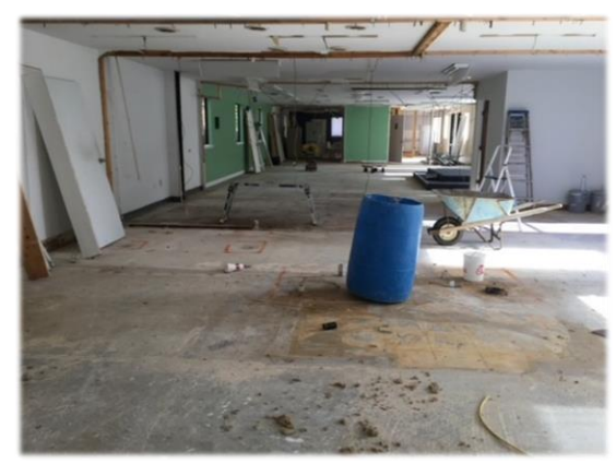
314 Second Street

When we have the required permit in hand, interior construction will begin. This will include drywall being repaired or replaced, fluorescent lights transitioned to LED in all new ceilings, one bathroom in each building expanded and brought up to ADA standards, tile flooring repaired or replaced, and interior painting of both buildings. Electrical work will be extensive