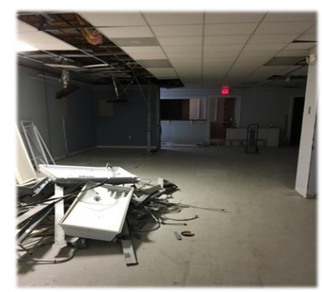
312 Second Street

I want to take this opportunity to give you a brief update on our pending move to new facilities at 312 and 314 Second Street in Williamsburg and the progress that has been made since our last newsletter. Following the <u>unanimous approval by the Williamsburg City Council</u> in mid-October of our request for a zoning variance, we selected a local firm, College Creek Construction, as our general contractor to perform interior demolition and construction. We received our demolition permit on December 3, and work started immediately with the electrical, plumbing and flooring sub-contractors out in force. By late last week, the demo work was almost completed and we've applied for a construction permit, which we hope to have shortly. The progress in three plus weeks has been gratifying.