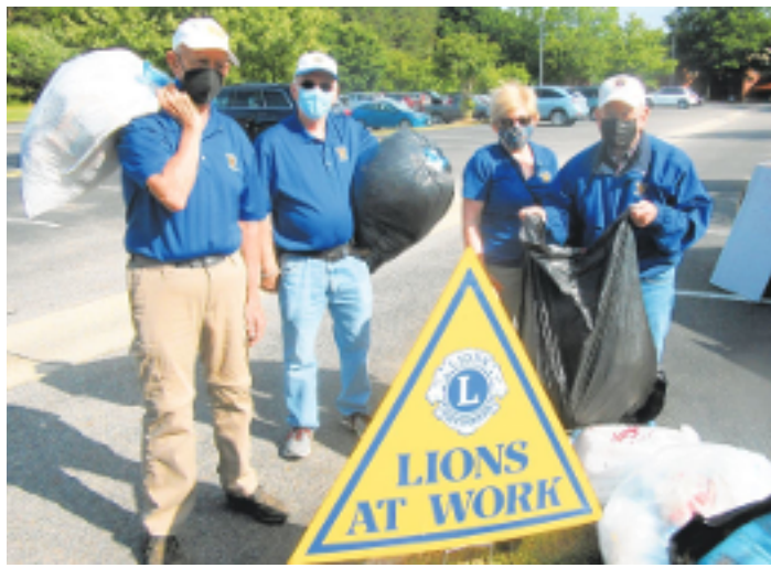
James City Lions Food Drive to benefit FISH.