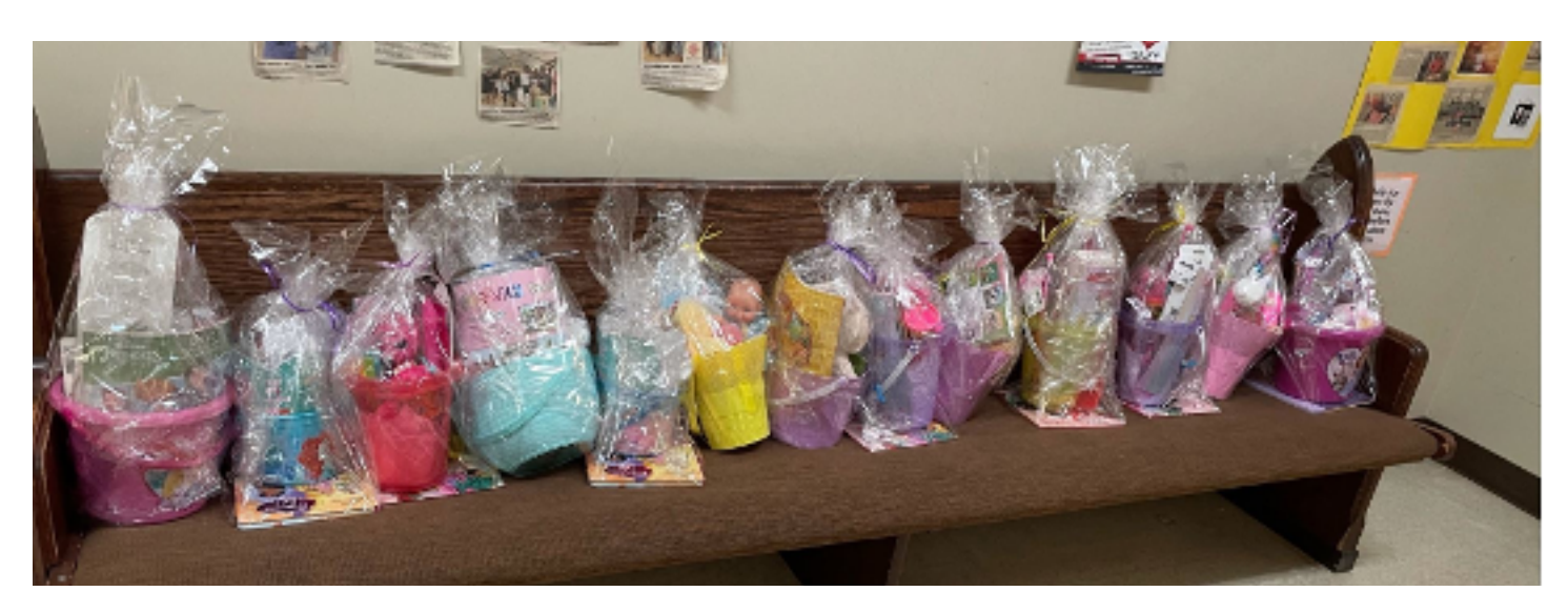
30 Easter baskets from an anonymous donor

Monday, May 31 (Memorial Day) Monday, July 5 (July 4th Observance) Monday, September 6 (Labor Day) Monday, October 11 (Columbus Day) Thursday, November 11 (Veteran's Day) Wednesday, November 24 (Closes at Noon) Thursday & Friday, November 25 & 26 (Thanksgiving Day and Following Day) Friday, December 24 (Christmas Eve) Friday, December 31 (New Year's Eve)