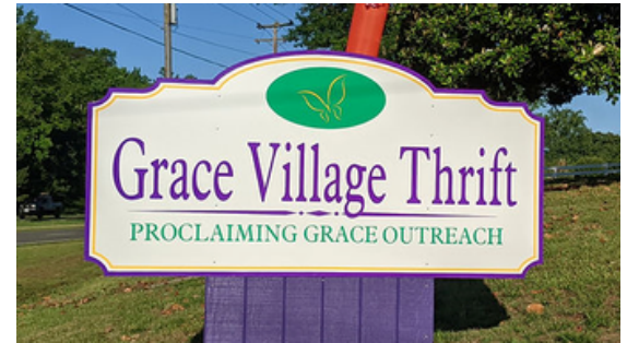
Proclaiming Grace Village Thrift Shop