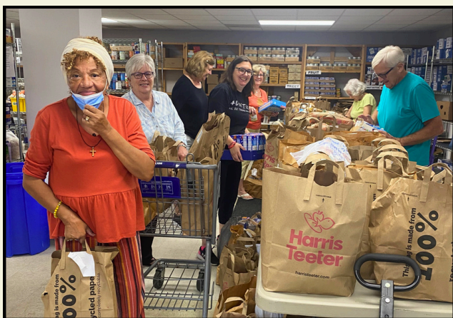
Many volunteers powered through the unloading and shelving of 531 bags!