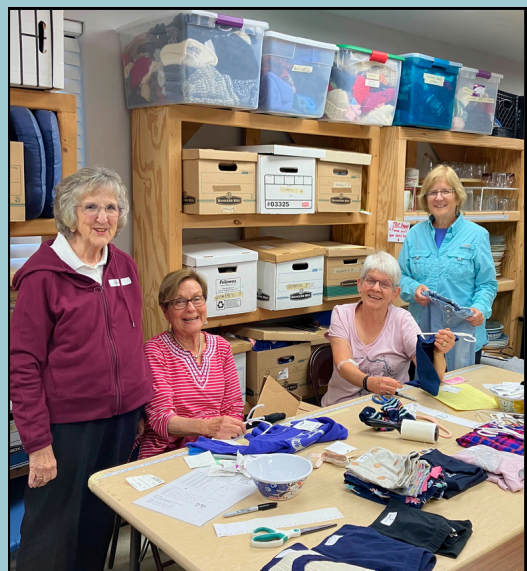
Some of the WBC volunteers preparing children's clothing for our shelves in September.

King of Glory Lutheran Church had their semi-annual Children's Consignment Sale earlier this month. FISH was among the nonprofits invited to select clothing at the end of the sale.