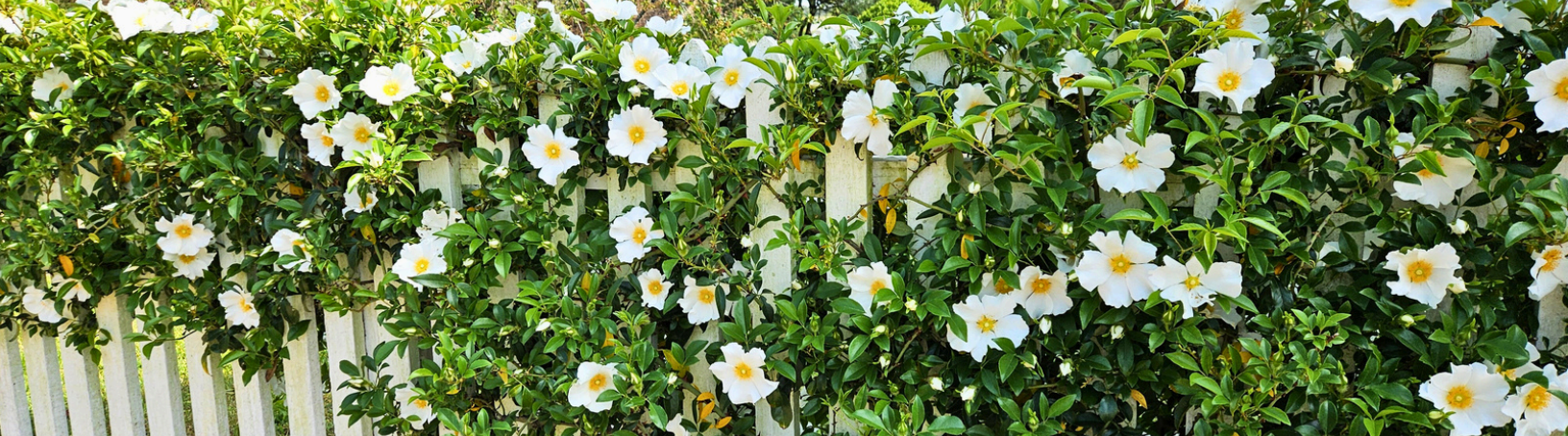
Rugosa Rose - Colonial Williamsburg