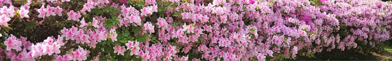
Azalea hedge - Nottingham Road