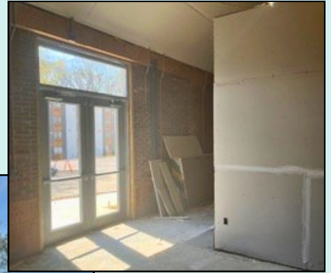
7129 Pocahontas Trail Renovations are well underway!