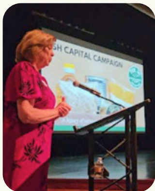
Click Photo for Video

Maura summarized, "Today's turnout shows how deeply this community believes in caring for one another. Every contribution - large or small - moves us closer to opening the doors of a permanent home that reflects the dignity of the people we serve."